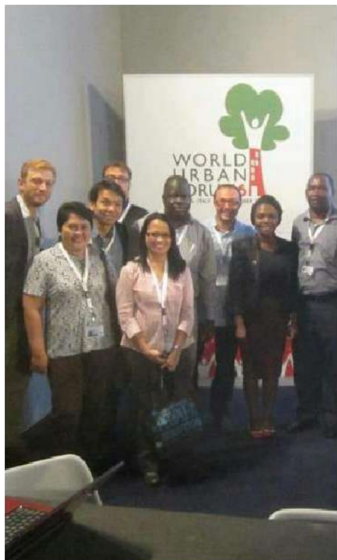
World Urban Forum - Naples 2012

All of the workshops encourage built environment professionals to reflect on participatory approaches to producing the built environment. The key objective has been to build methodologies and approaches to participatory design that work with civil society actors strategically towards the advancement of social justice in cities, addressing multiple scales (from the dwelling to the city) of the production of space, engaging explicitly with social diversity within communities, and enabling interdisciplinarity needed to advance the social production of habitat.