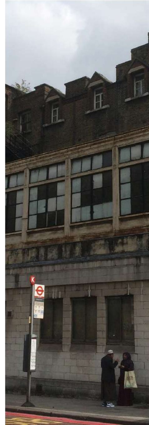
Change by Design London, UK 2014

In partnership with: Quito 13: Gobierno Barrial de Atucucho (GBA), Comité de Desarrollo Comunitario Los Pinos (CDCLP), CONBADE The National Confederation of Barrios of Ecuador, Instituto de Altos Estudios Nacionales (IAEN), Universidad Politécnica Salesiana (UPS).