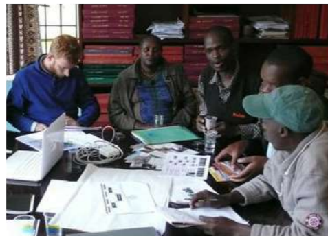
Nairobi, Kenya - work alongside