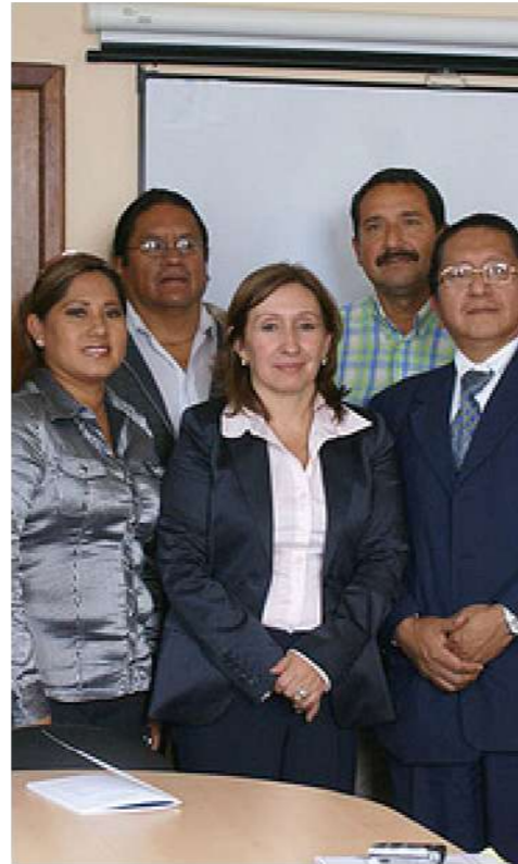
National Federation of Neighbourhood Associations in Ecuador