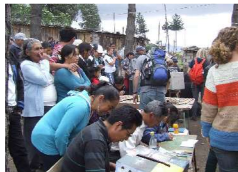
Quito, Ecuador - work alongside