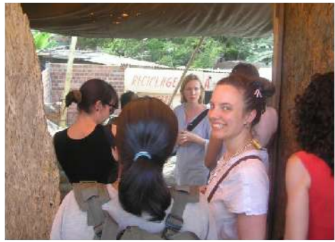
Salvador, Brazil - Group