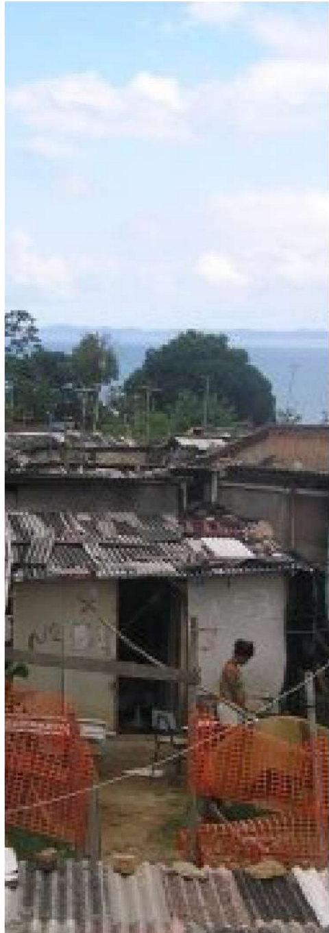
Building Communities #4 & #5 Salvador De Bahia, Brazil 2009-10

In partnership with: Salvador 09: MSTB, Sociedade Primeiro de Maio Salvador 10: MSTB