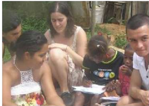
Salvador, Brazil - Participation