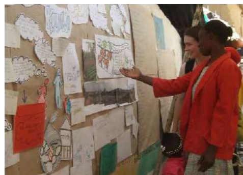
Nairobi, Kenya - Participation