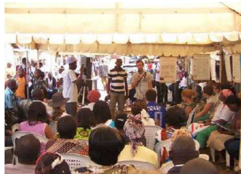
Nairobi, Kenya - dissemination