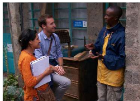
Nairobi, Kenya - Participation