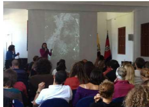
Quito, Ecuador - dissemination