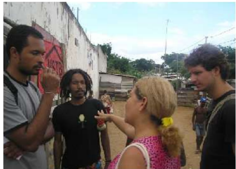
Salvador, Brazil - dissemination

In Brazil, together with the Movimento dos Sem Teto da Bahia we met with the governor of the state of Bahia as well as carrying out a pilot workshop involving community groups, government officials and local professionals. In Nairobi our local partner Pamoja Trust capitalized on our workshop and products to raise visibility of the need for participatory processes to informal settlement upgrading in Kenya; in Quito, the community of Los Pinos used the workshop and report to enable access to security of tenure and illustrate a precedent for participatory means to build neighbourhoods in line with Buen Vivir principles; and our work in London with Citizens UK considers the social impact of the recently proposed high speed rail upgrade (HS2) at London Euston Station, with the aim of feeding into wider sets of recommendations for more democratic and inclusive forms of regeneration.