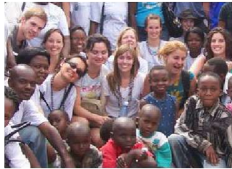
Nairobi, Kenya - Group