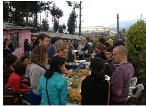
Quito, Ecuador - Group