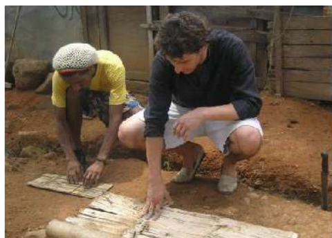
Salvador, Brazil - Participation