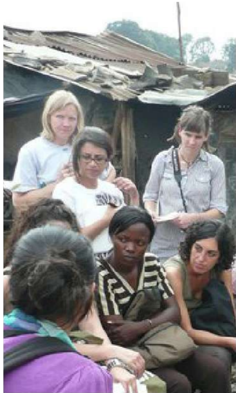
Cross Scale Focus: Policy & Planning