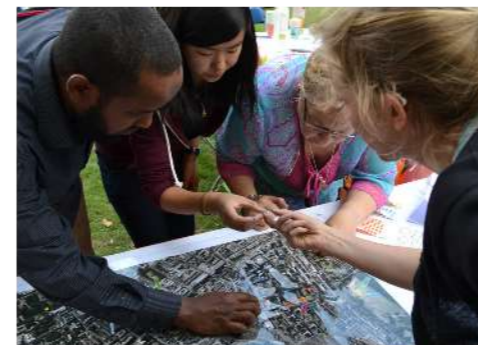
London, UK - St James Garden Participation