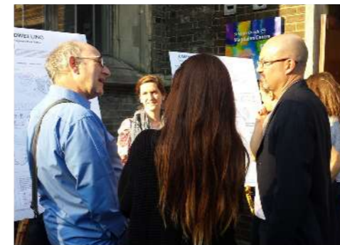
London, UK - work alongside