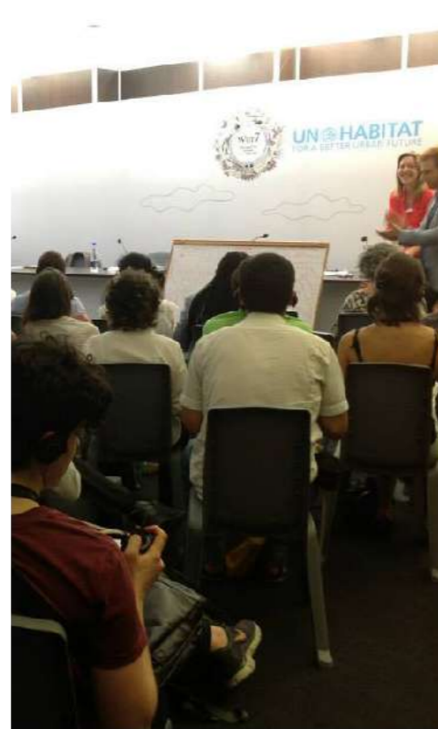
World Urban Forum - Medellin 2014