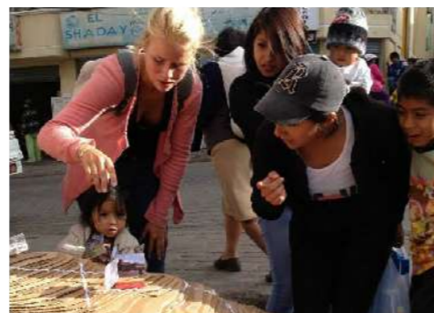
Quito, Ecuador - Participation