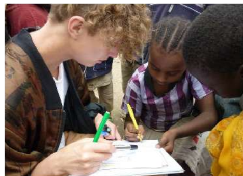
Nairobi, Kenya - Participation