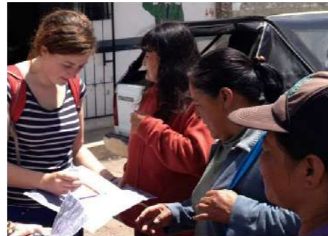
Quito, Ecuador - Participation