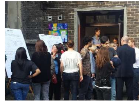
London, UK - Group