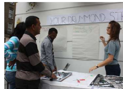
London, UK - Drummond Street Participation