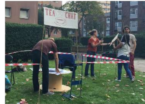
London, UK - Regents Park Estate Participation