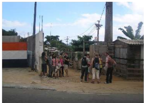
Salvador, Brazil - work alongside