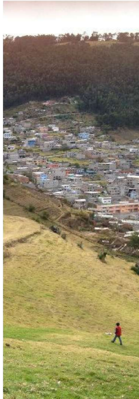
Change by Design Quito, Ecuador 2013

In partnership with: Nairobi 11: Pamoja Trust, UN-HABITAT