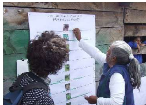
Quito, Ecuador - Participation