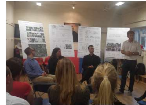
London, UK - dissemination