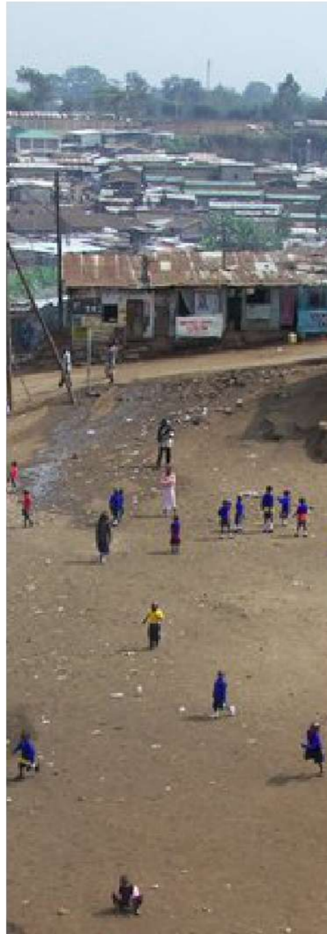
Change by Design Nairobi, Kenya 2011

In partnership with: Salvador 09: MSTB, Sociedade Primeiro de Maio Salvador 10: MSTB