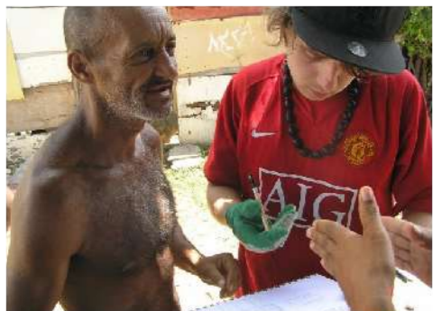
Salvador, Brazil - Participation